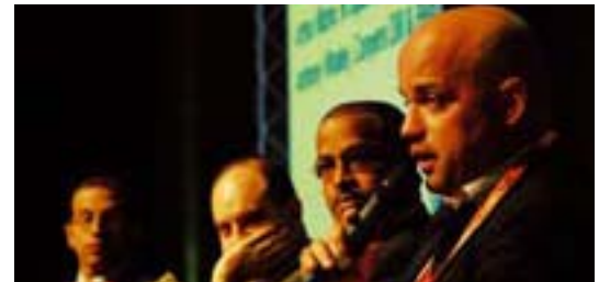
Interact with industry experts in the panel sessions

The meeting provides an in-depth analysis of generic medicine strategy, policy and case studies from a number of emerging markets – which continue to out perform the mature markets – providing a unique overview of affordable medicines within an international platform.