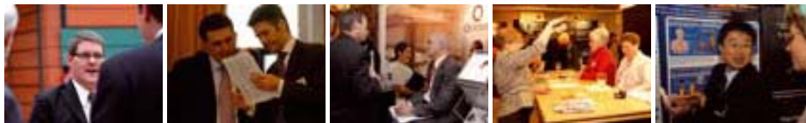
Meet and do business with generics industry decision makers.