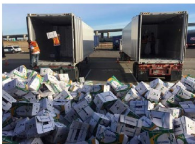
Illegally imported Chinese garlic

GAET targeted entries of Chinese garlic valued at over $16.84 million that were high-risk for evasion of antidumping duties. GAET required posting of additional single transaction bonds to strengthen security for revenue in jeopardy prior to the release of these shipments. Single transaction bonds can be thought of as an “insurance policy” for the government to assist with our ability to collect money due if there is nefarious activity involved in the transaction. Four importers/exporters challenged CBP’s authority to require additional bonding and filed several lawsuits at the Court of International Trade (CIT). As a result of the GAET enforcement efforts, CIT upheld CBP’s ability to request single transaction bonds.