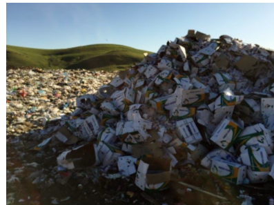
Illegally imported Chinese garlic

This resulted in shipments valued at over $5.8 million being exported back to the country of origin, as importers did not want to file additional bonds; shipments valued at over $6.9 million being exported or destroyed; and shipments valued at over $4 million released after an importer posted a $1 million bond with CIT. The GAET team also protected revenue of over $137 million from many entries in the assessment of the correct antidumping duty rate. CBP remains committed to enforcing the legal importation of garlic, as well as other commodities.