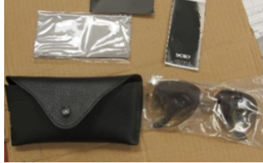
Seized counterfeit merchandise

It is difficult to conduct targeting in the express consignment environment, so as part of the daily assigned duties, CBP officers responsible for targeting and