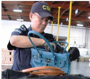
Seized counterfeit merchandise

examinations periodically examine incoming shipments at the express carrier hub. Seizures of significant values made by CBP officers at the beginning of the fiscal year have already exceeded the MSRP for Orlando in FY 2015.