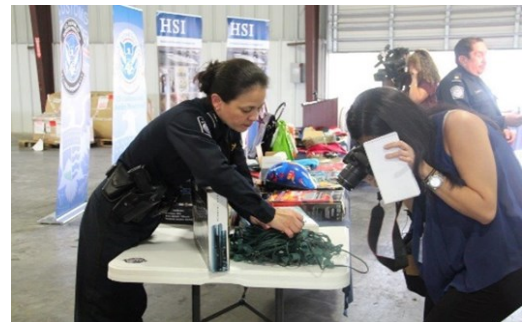
CBP personnel showing media representative sample of seized Christmas lights

The CBP Houston Seaport trade team looks forward to continued success by working innovatively and collaboratively to enforce U.S. trade laws that support the economy and protect consumers.