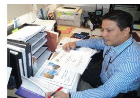
Import specialist's vigilance and dedication to duty resulted in million dollar revenue recovery for CBP.

The import specialist processed the request for redelivery for the U.S. Food and Drug Administration refusal and issued liquidated damages for failing to comply with the request. But the import specialist didn't stop there. As part of the Free Trade Agreement Annual Verification Plan, he took the opportunity to perform an FTA verification for that company. During the verification, he discovered an error and followed through with the findings, resulting in a substantial positive impact in revenue recovery for CBP.