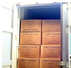
Falsely classified Chinese wire hangers

CBP imposed $3.9 million in civil penalties on three importers for evading the antidumping duty order on wire hangers from China. CBP found these importers failed to properly report the imports as subject to antidumping and failed to pay the antidumping duties. This resulted in a potential loss of revenue of $3.4 million in antidumping duties. CBP found the importers to be negligent by making false statements and false invoicing. CBP is continuing its enforcement of the antidumping duty orders on wire hangers from China, Vietnam and Taiwan.