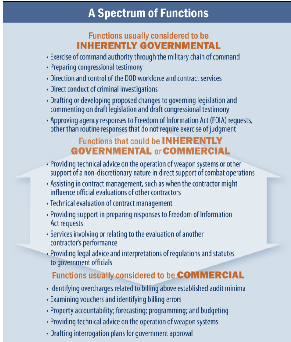
Figure I. Categorization of Functions as Inherently Governmental or Commercial

protection of resources ... in uncontrolled or unpredictable high-threat environments should ordinarily be performed by members of the Armed Forces.” 187